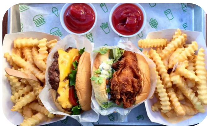
Shake Shack JBR Dubai UAE - Average Fans Speed

The implementation of Intelli-Hood's DCKV system at Shake Shack in JBR, Dubai successfully demonstrated substantial operating expense savings, achieved a 1-year payback, and significantly lowered carbon emissions by optimizing their kitchen's exhaust and ventilation system. Intelli-Hood not only lowered their utility costs, but improved their overall sustainability as well.